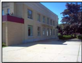
Sign, Northwest Side