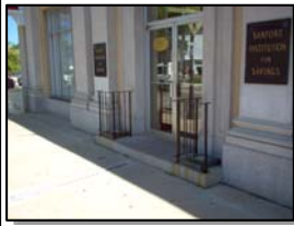
Signs, Main Street Entrance