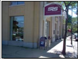
Sign, West Corner