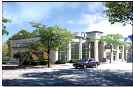
Rendering of Proposed SIS Expansion